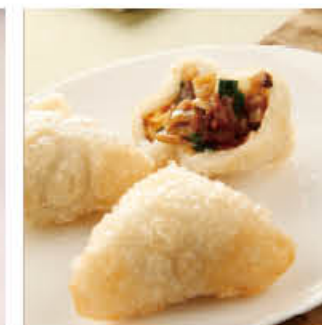
家鄉咸水角 Deep Fried Chicken and Chives Dumpling (Football)