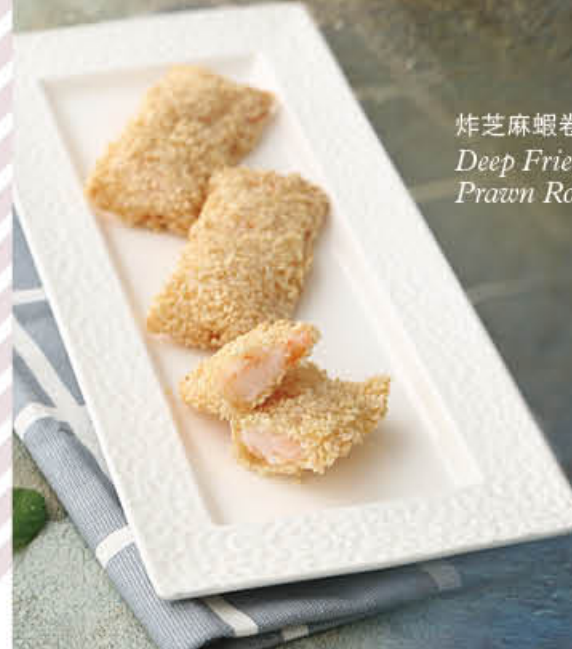
炸芝麻蝦卷 Deep Fried Sesame Prawn Roll