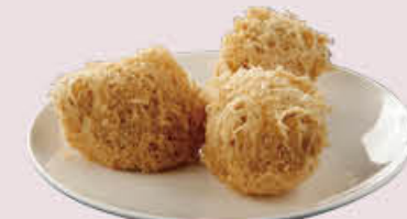
蜂巢炸芋角 Crispy Fried Mashed Taro Dumpling Stuffed with Chicken Mince