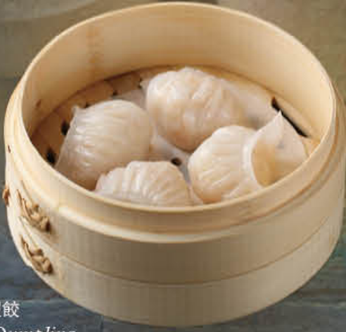
水晶鮮蝦餃 Prawn Dumpling