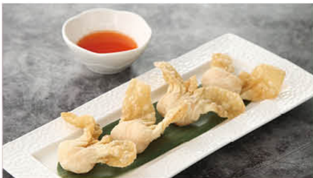
鮮蝦雲吞 Deep Fried Prawn Wonton