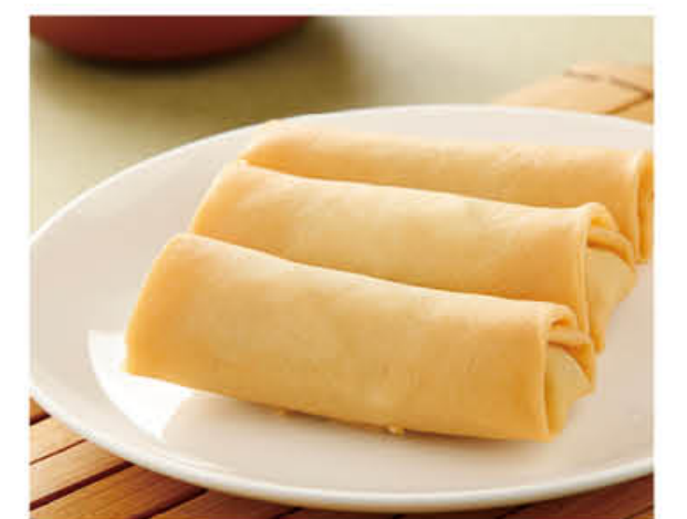
炸鷄絲春卷 Chicken Spring Rolls