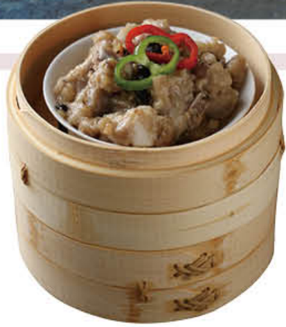
蒜香蒸排骨 Pork Spare Ribs with Garlic and Black Bean Sauce