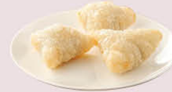
香炸豆沙角 Deep Fried Glutinous Dumpling Stuffed with Red Bean Paste