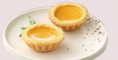
酥皮焗蛋撻 Baked Egg Custard Tart