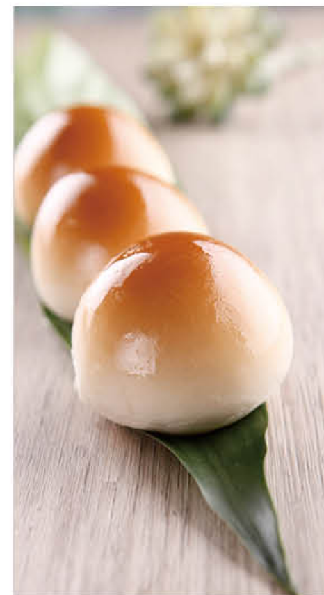
焗叉燒餐包 Baked Barbecue Pork Bun