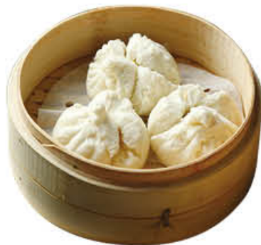
香菇鷄包仔 Chicken and Mushroom Bun