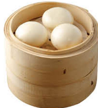
香滑奶皇包 Custard Bun