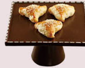
香焗叉燒酥 Baked Barbecue Pork Pastry Topped with Sesame