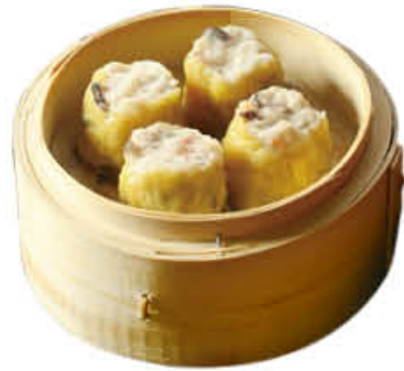
香菇豬肉燒賣 Pork Dumpling with Shrimp and Black Mushroom