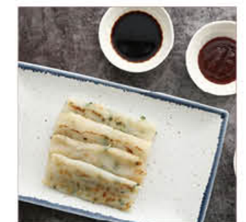
香煎蝦米腸 Pan Fried Rice Noodle Roll with Shallot and Dried Shrimp