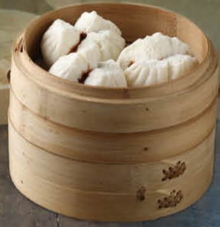
蜜汁叉燒包 Barbecued Pork Bun