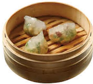
潮州蒸粉粿 Chicken Dumpling with Focama and Dried Shrimp in Satay Sauce