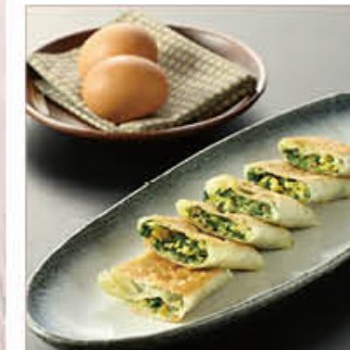
煎炸韭菜餅 Pan Fried Shrimp and Chives Spring Roll