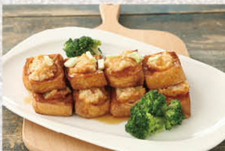
菲王炸釀豆腐 $ 29.8 /份

Fried 3 Types Vegetables Stuffed with Mince Prawn