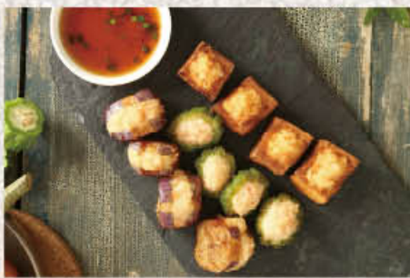
煎釀三寶 $ 32.8 /份

Grilled Whole Squid Brushed with Teriyaki and Sweet Soy Sauce on Stir Fried Glutinous Rice