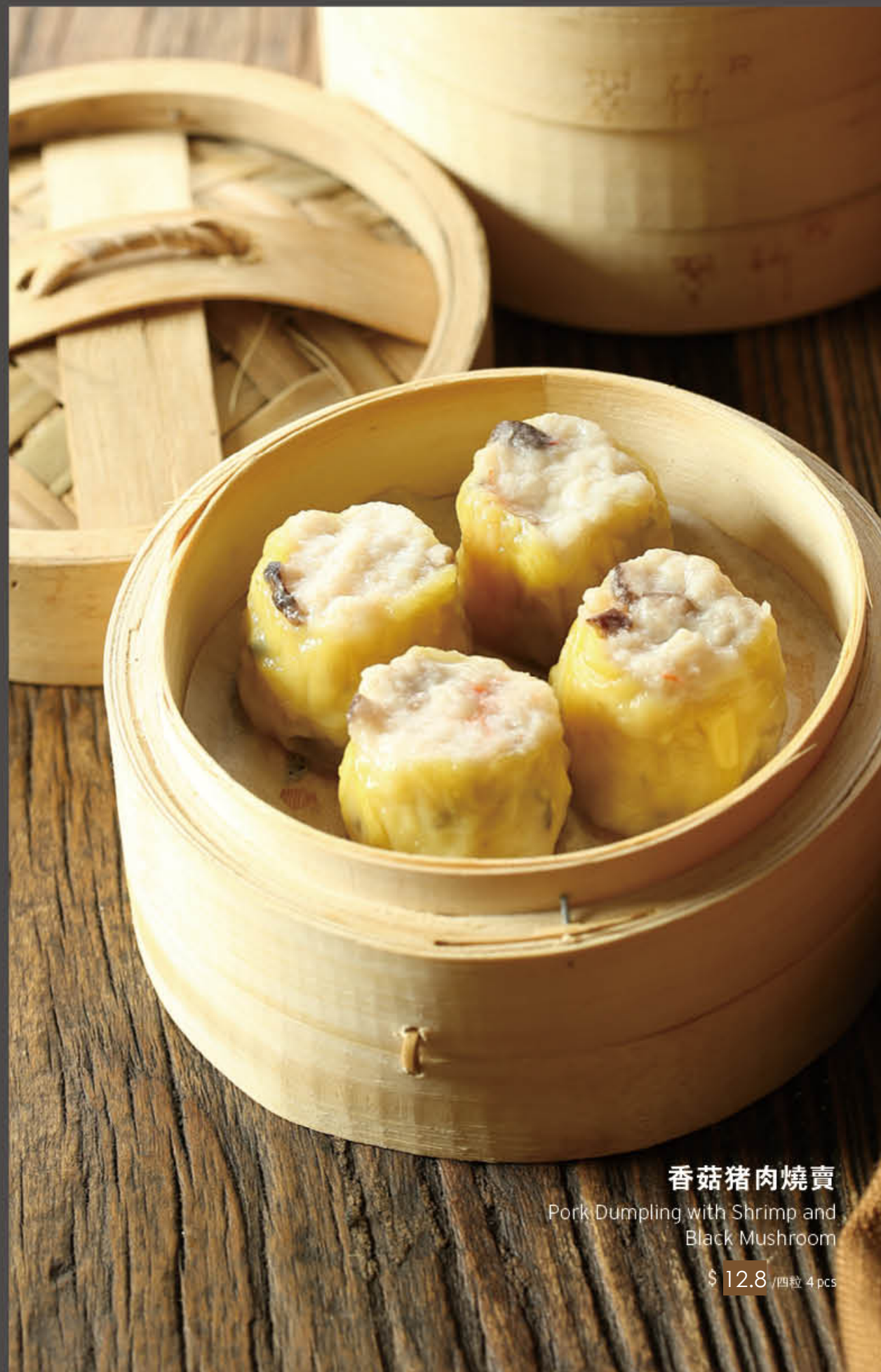
香菇猪肉燒賣 Pork Dumpling with Shrimp and Black Mushroom $ 12.8 /四件 4 pcs