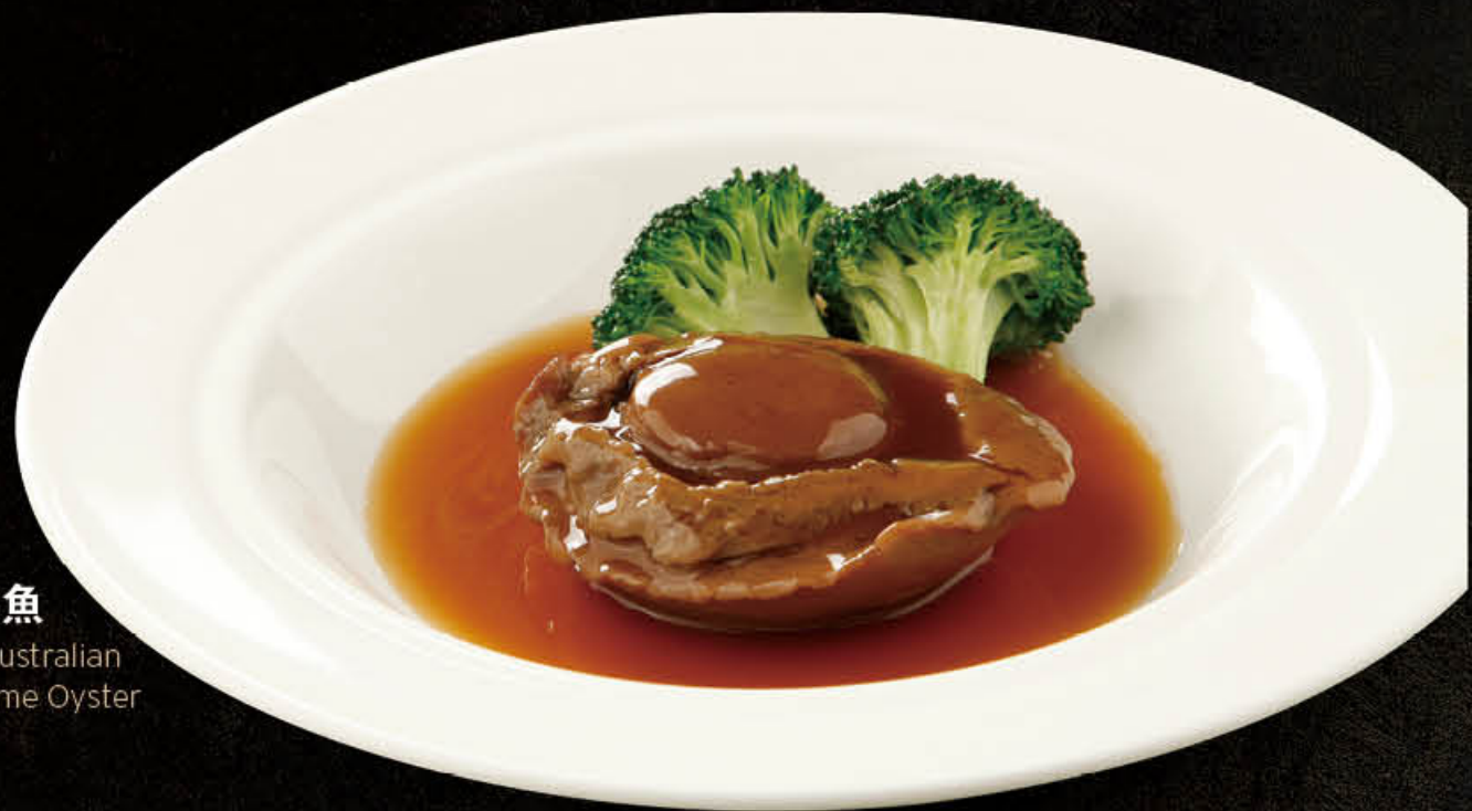
蠔皇慢煮澳洲青邊鮑魚 12 Hour Slow Cooked Live Australian Green Lip Abalone in Supreme Oyster Sauce