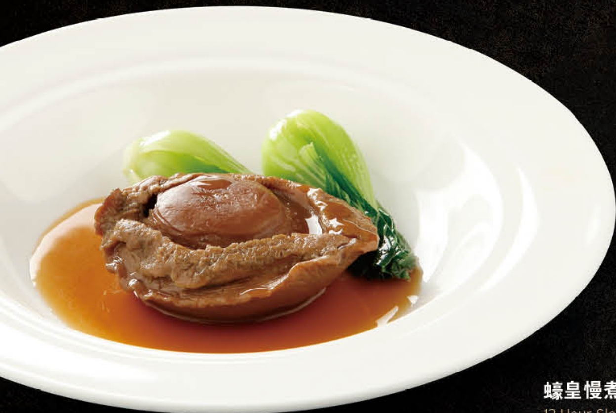
蠔皇慢煮澳洲黑邊鮑魚 12 Hour Slow Cooked Live Australian Black Lip Abalone in Supreme Oyster Sauce