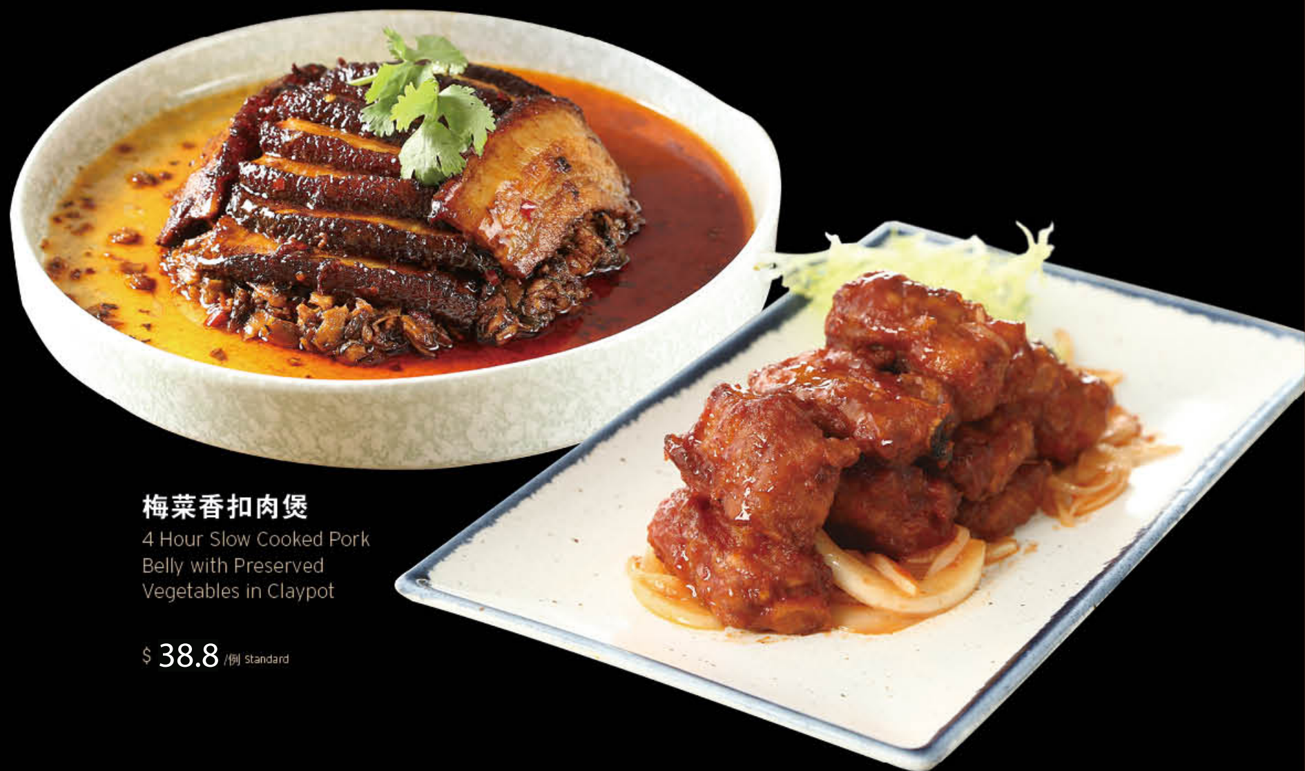
梅菜香扣肉煲 4 Hour Slow Cooked Pork Belly with Preserved Vegetables in Claypot