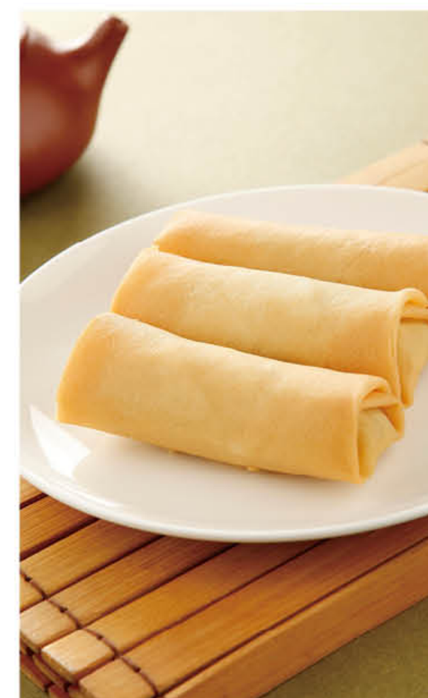
炸雞絲春卷 Chicken Spring Rolls $ 9.8 /四件 4pcs