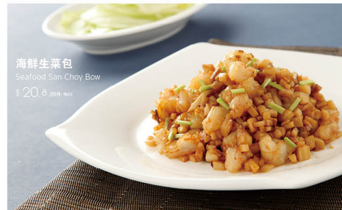
海鮮生菜包 Seafood San Choy Bow $ 20.8 /四件 4pcs