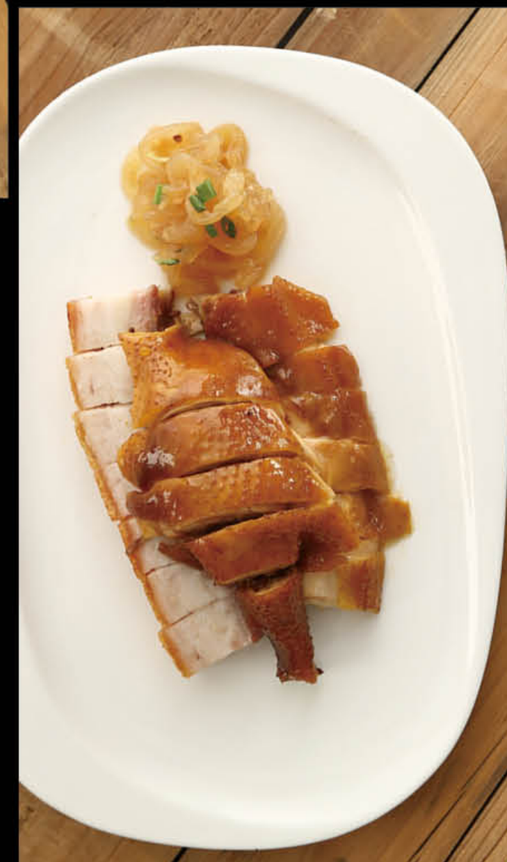
燒味雙拼 (自選兩款) * Barbecued Platter 2 Choices *