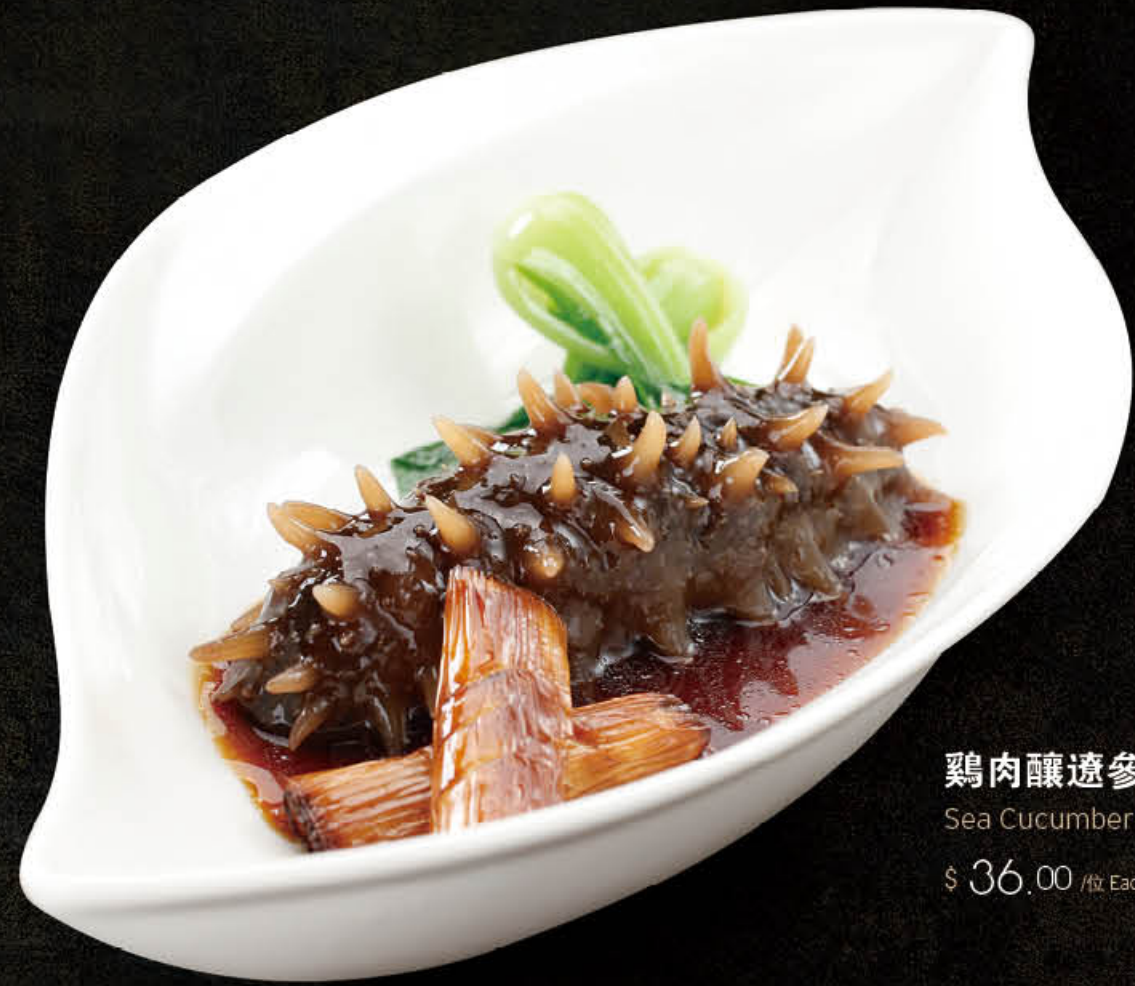
鷄肉釀遼參 Sea Cucumber Stuffed with Chicken Mince $ 36.00 /位 Each