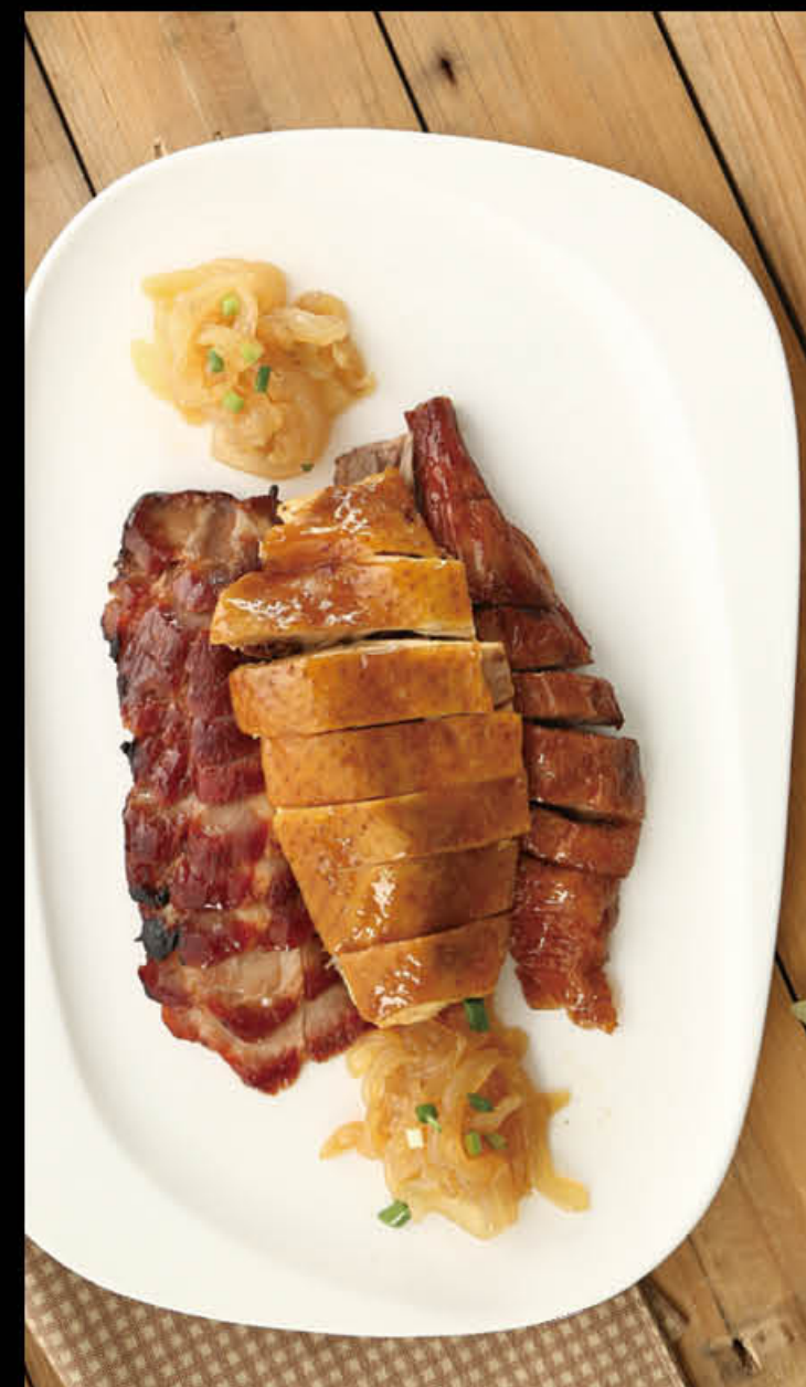
燒味三拼 (自選三款) * Barbecued Platter 3 Choices *