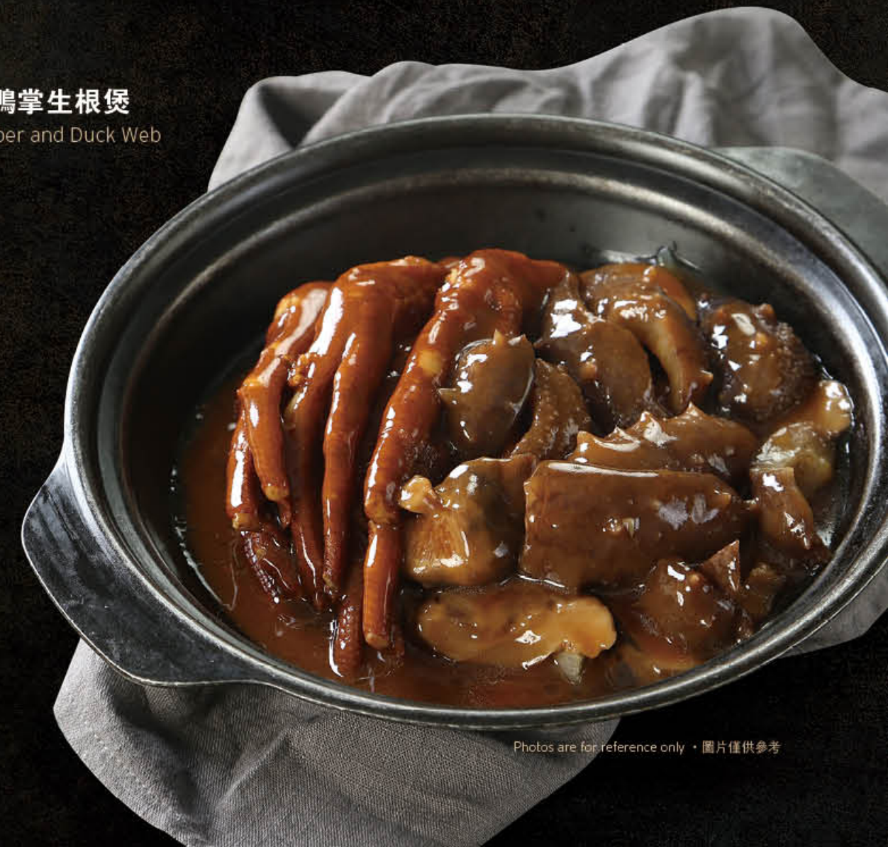
紅燒碧綠海參鴨掌生根煲 Braised Sea Cucumber and Duck Web Served in Claypot $ 48.8 /例 Standard