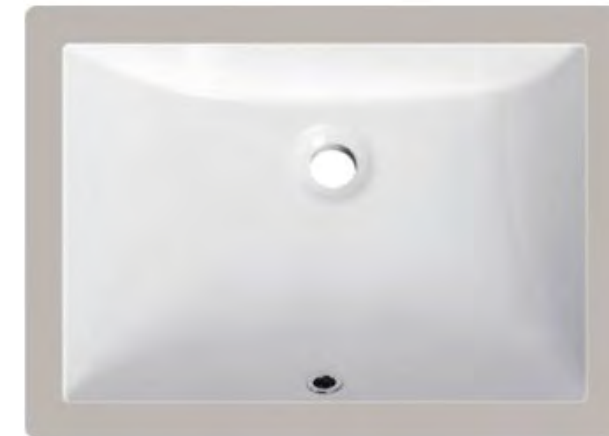
ADA COMPLIANT UNDER MOUNT WHITE PU-912ADA (20 1/6 x 15 x 5 3/4)