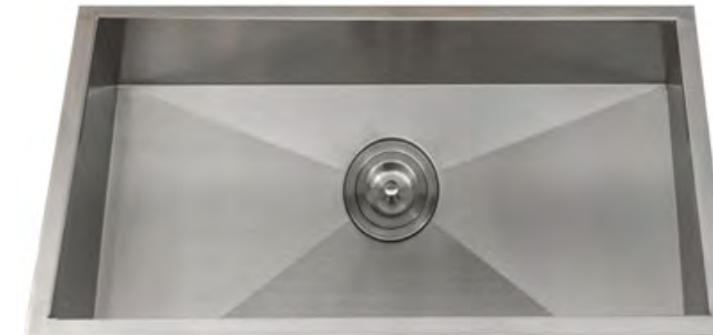
BIG SINGLE BOWL UNDERMOUNT Zero Radius Corner Hand Made Square ADA Compliant Sink SS-ADA-ORi-S2818 (28 x 18 x 5 1/2)