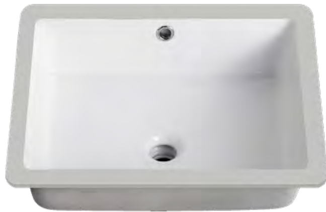
UNDERMOUNT WHITE PU-06W (19 1/2 x 15 1/2 x 6 7/8)