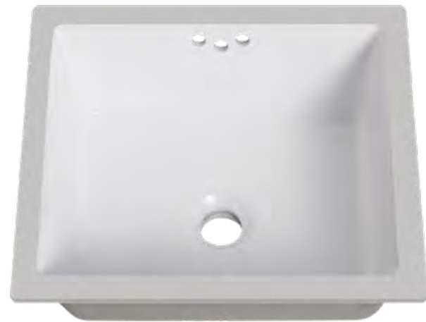
UNDERMOUNT WHITE PU-07W (15 7/8 x 14 x 7)