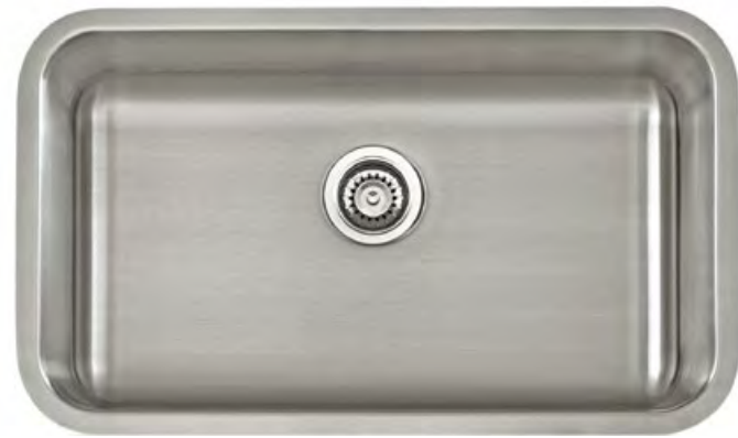
BIG SINGLE BOWL UNDERMOUNT SS-ADA-S30 (30 x 18 x 5 1/2)

The SPECIALTY Group is a collection of resourceful sinks for defined tasks. Premium 18 gauge 304 stainless steel easy to clean satin finish plus our 5 - Side sound baffling. The SPECIALTY Group is a gathering of elite performance sinks.