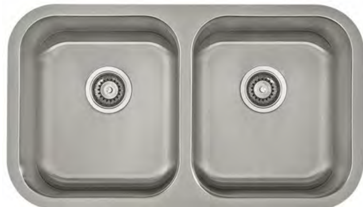
DOUBLE EQUAL BOWL UNDERMOUNT SS-ADA-D32 (32 x 17 x 5 1/2)