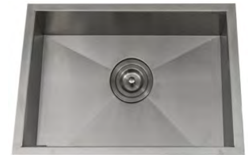
MEDIUM SINGLE BOWL UNDERMOUNT Zero Radius Corner Hand Made Square ADA Compliant Sink SS-ADA-ORi-S2318 (23 x 18 x 5 1/2)