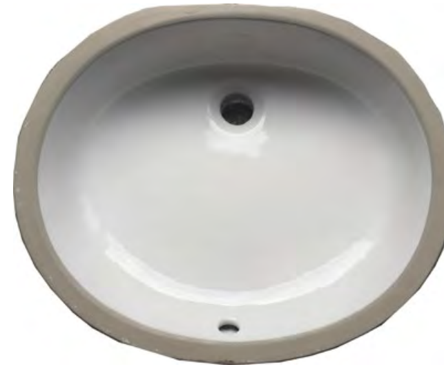
ADA COMPLIANT UNDER MOUNT WHITE PU-911ADA (19 7/8 x 16 3/8 x 5 1/4)