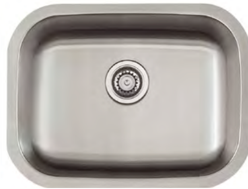
SINGLE BOWL UNDERMOUNT SS-ADA-S23 (23 x 21 x 15 1/2)