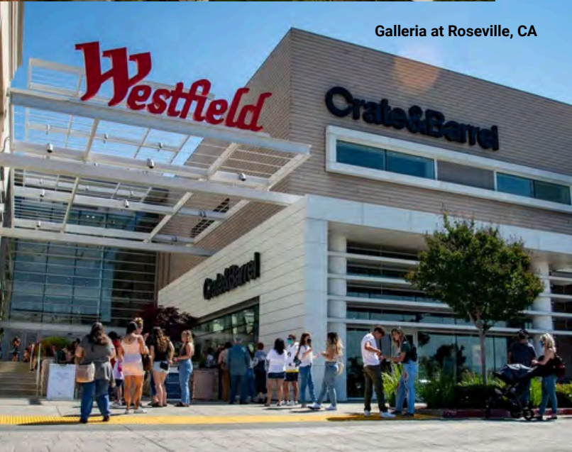
Galleria at Roseville, CA