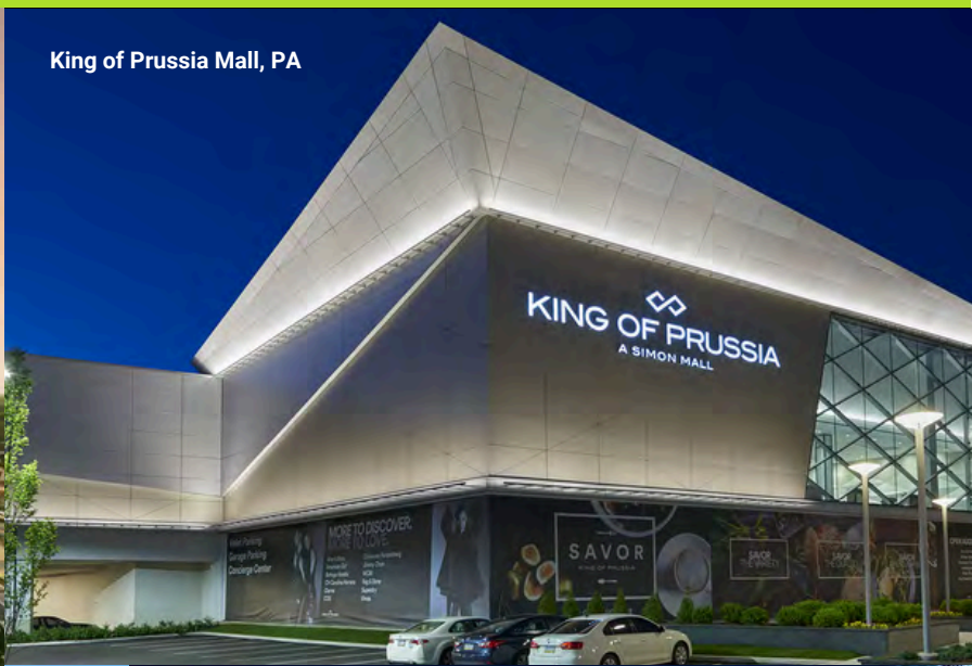
King of Prussia Mall, PA