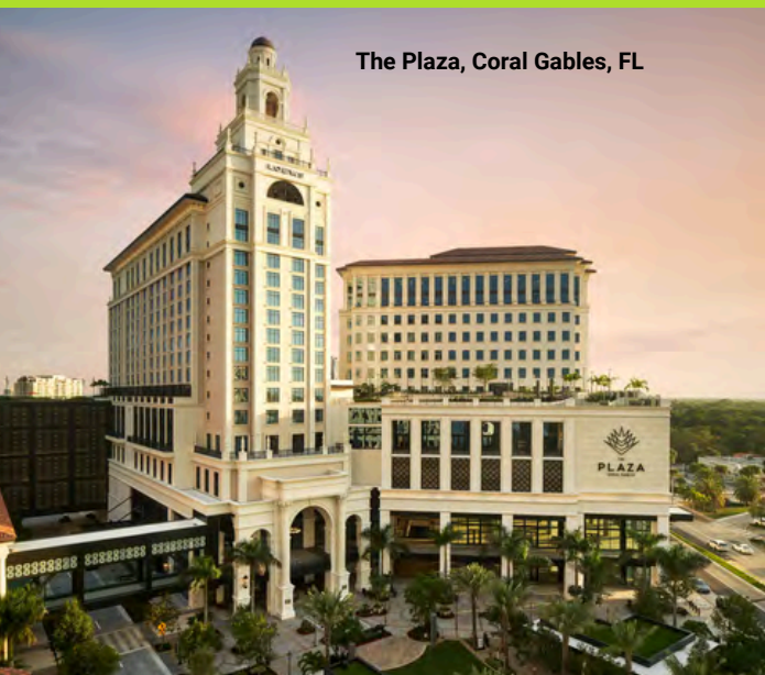
The Plaza, Coral Gables, FL