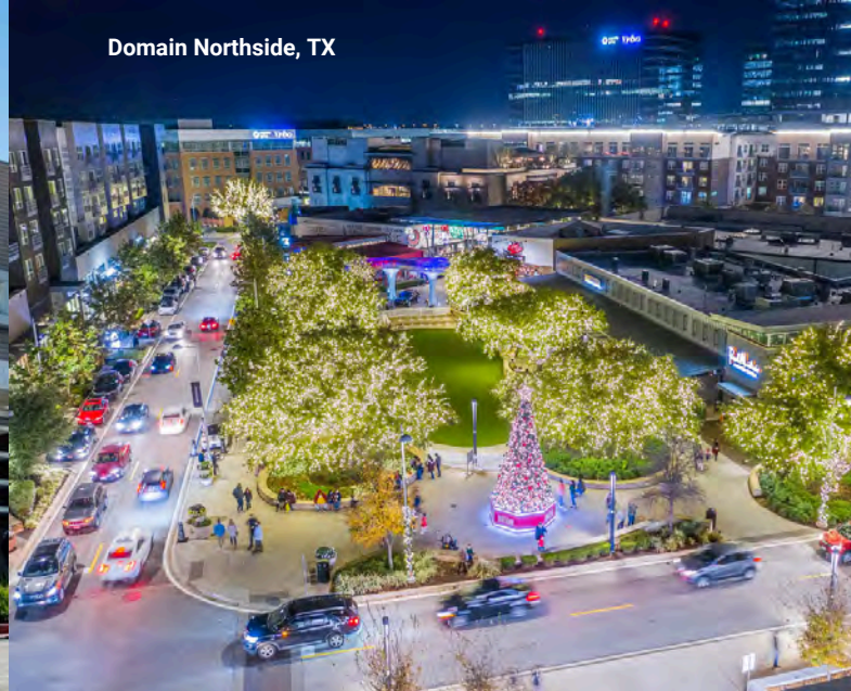
Domain Northside, TX