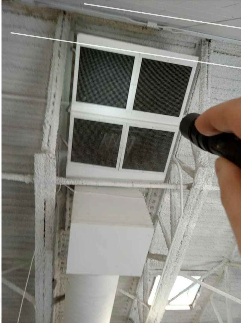
6 6-HVAC Filters 2 Date Taken: 2/20/2024 Discoloration near return Filter appears displaced

Florida Licensed Mold Remediator State License # MRSR4792 4200 18th St W Bradenton FL 34205 941-705-8161