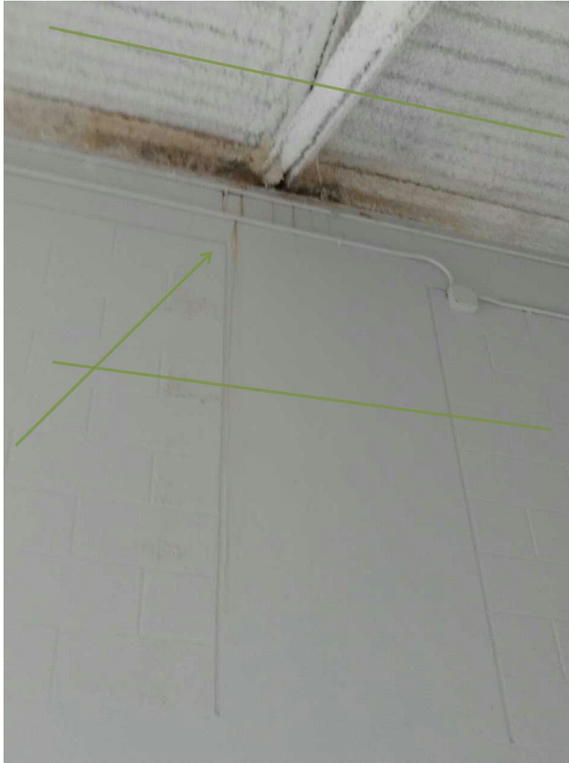
10 10-Hallway Discolored

Florida Licensed Mold Remediator State License # MRSR4792 4200 18th St W Bradenton FL 34205 941-705-8161