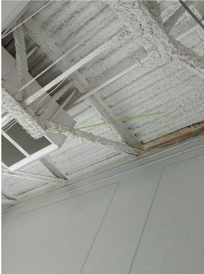
11 11-Wall & Ceiling

Florida Licensed Mold Remediator State License # MRSR4792 4200 18th St W Bradenton FL 34205 941-705-8161