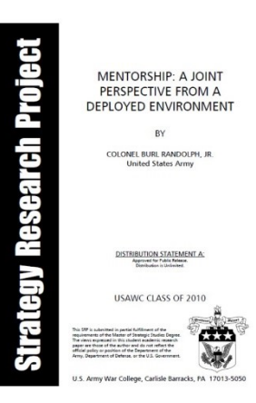
A Master's Thesis