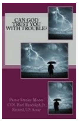
Co-Author, Nonfiction, Personal Narrative