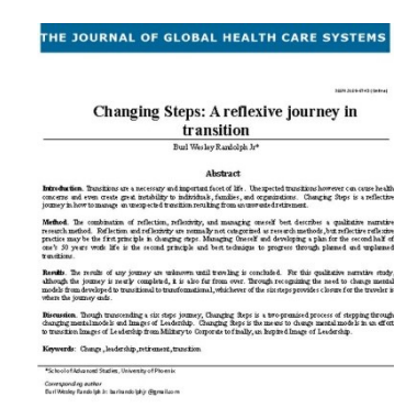
Author, Personal Narrative

Mentoring Leaders Across Race and Gender Lines: Insight from US Army Officers Article DOI: 10.1002/joe.21931