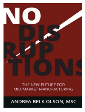
Editor, Business, Manufacturing