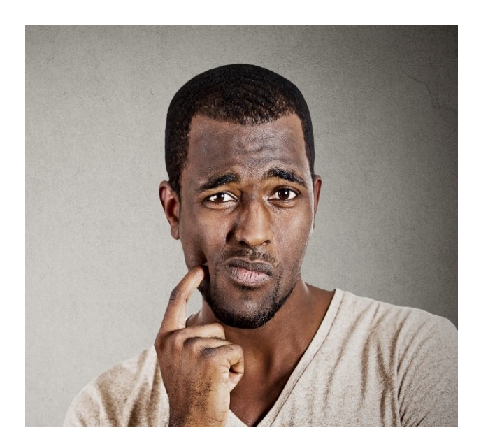
How else can we walk in Jesus' footprints?