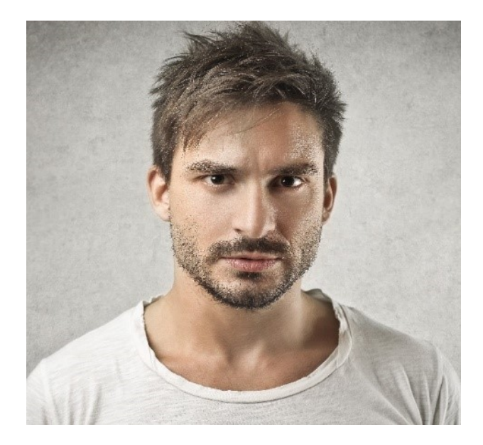
Come on. That can't be all there is to it.