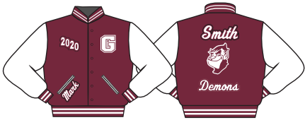
Jacket shown with CHENILLE PREMIUM upgrade (first name, last name, year, mascot, and mascot name)

Style Number: 5101 Sizes: S - 3XL Jacket Price (BLANK): $209.95 Add $15 for 2XL; Add $30 for 3XL