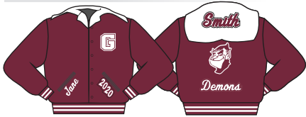
Jacket shown with CHENILLE PREMIUM package.

Style Number: 5300 Sizes: XS - 3XL Jacket Price (BLANK): $179.95 Add $15 for 2XL Add $30 for 3XL