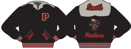
Jacket shown with CHENILLE PREMIUM package.

Style Number: 5300 Sizes: XS - 3XL Jacket Price (BLANK): $179.95 Add $15 for 2XL Add $30 for 3XL