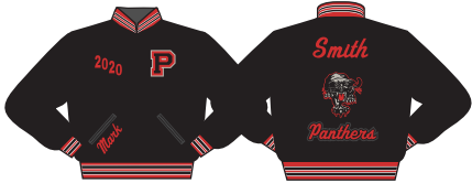
Jacket shown with CHENILLE PREMIUM upgrade (first name, last name, year, mascot, and mascot name)

Style Number: 5101 Sizes: S - 3XL Jacket Price (BLANK): $209.95 Add $15 for 2XL; Add $30 for 3XL