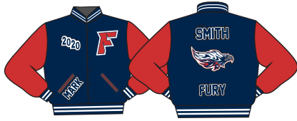
Jacket shown with CHENILLE PREMIUM upgrade (first name, last name, year, mascot, and mascot name)

Style Number: 5101 Sizes: S - 3XL Jacket Price (BLANK): $209.95 Add $15 for 2XL; Add $30 for 3XL