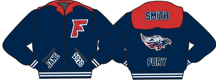
Jacket shown with CHENILLE PREMIUM package.

Style Number: 5300 Sizes: XS - 3XL Jacket Price (BLANK): $179.95 Add $15 for 2XL Add $30 for 3XL