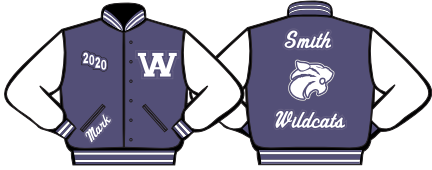
Jacket shown with CHENILLE PREMIUM upgrade (first name, last name, year, mascot, and mascot name)

Style Number: 5101 Sizes: S - 3XL Jacket Price (BLANK): $209.95 Add $15 for 2XL; Add $30 for 3XL