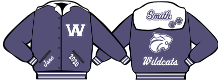
Jacket shown with CHENILLE PREMIUM package.

Style Number: 5300 Sizes: XS - 3XL Jacket Price (BLANK): $179.95 Add $15 for 2XL Add $30 for 3XL