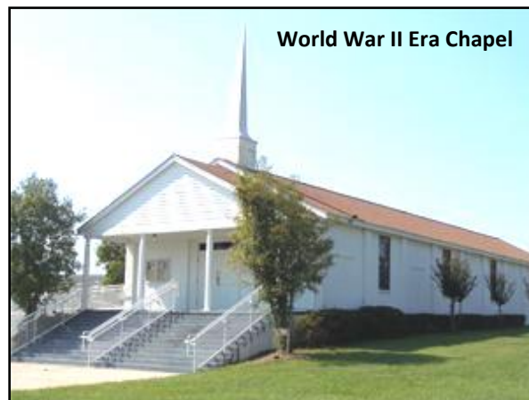
World War II Era Chapel