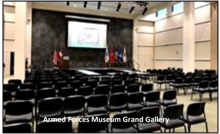
Armed Forces Museum Grand Gallery