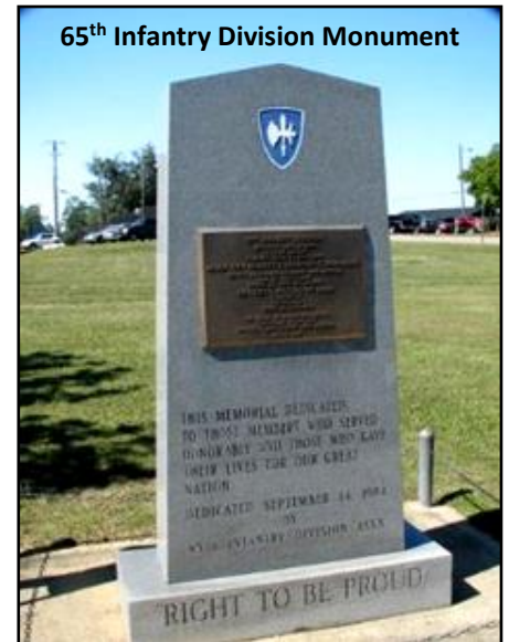
65 th Infantry Division Monument

At the conclusion of the memorial service, we will proceed to the 65 th Infantry Division monument for a wreath laying ceremony, taps, and a missing man flyover by L-Bird airplanes. L-Birds were used during WWII for reconnaissance and as artillery spotters.