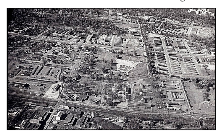
War II. This is where the Veterans were prior to boarding ships to Europe in January 1945. Here we will be able to visit the small museum and hear a presentation about the history of the camp.

Following lunch, we will board the bus and take a bus ride to Camp Shanks, located in Orangeburg, New York on the Hudson River. The camp was the largest U.S. Army embarkation camp used during World War II. Camp Shanks served as a staging area for troops departing the New York Port of Embarkation for overseas service during World