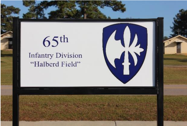
Temporary sign dedicated in 2021.

The Mississippi Armed Forces Museum reached out to the Association regarding sponsoring a permanent sign for the 65 th Infantry Division parade field that was dedicated at Camp Shelby in 2021. The sign would include information about the 65 th Infantry Division. It would be similar to other WWII signs throughout Camp Shelby. The Association will cover the first $1000 and are looking for donations to complete the project. The sign would recognize the 65 th Infantry Division Association as the sponsor.