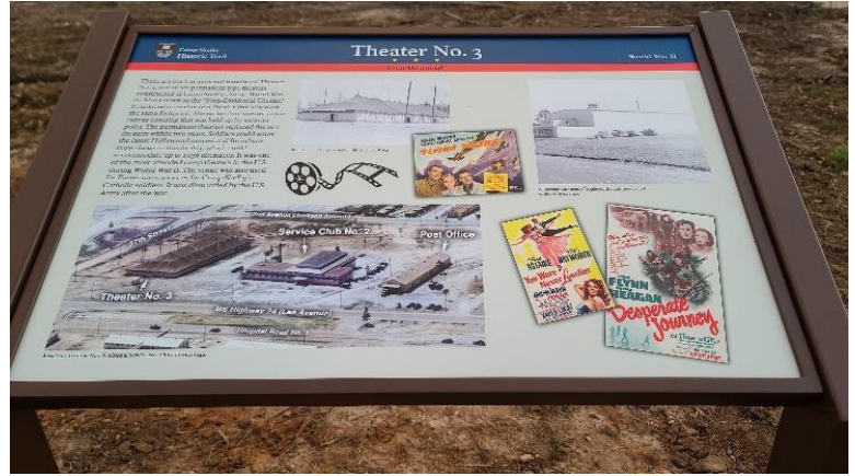
Proposed sign would be similar to this sign with 65 th information.

If you would like to donate to this project—the cost is approximately $2500 . . .