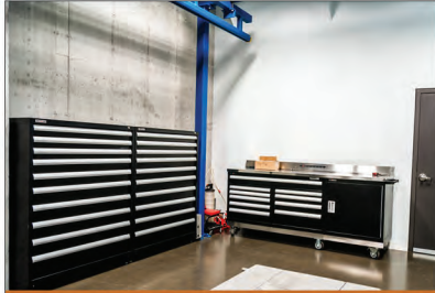
MODULAR DRAWERS & WORKSTATIONS