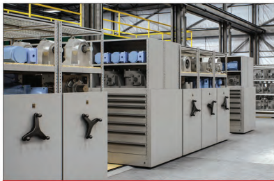
HIGH DENSITY SOLUTIONS