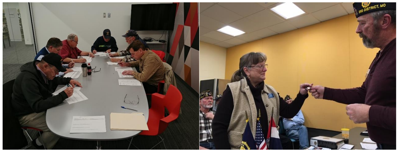
Boys State application review