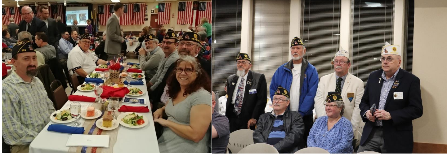
St. Michaels benefit luncheon