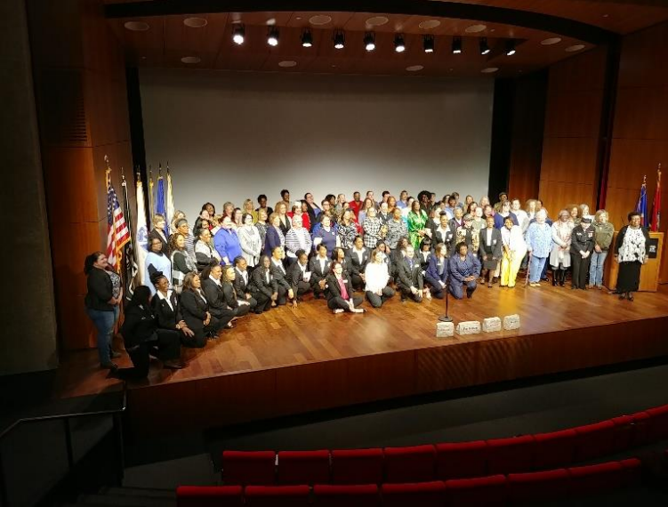
Salute to Women Veterans