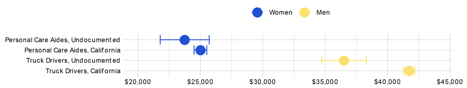
FIGURE 1: COMPARISON OF MEDIAN INCOMES WITHIN OCCUPATIONS, UNDOCUMENTED WOMEN AND MEN

Note: Estimates represent annual median income for full-time year-round worker, 2019 dollar. Source: Gender Equity Policy Institute estimates compiled from ACS (2015-2019). GENDER EQUITY POLICY INSTITUTE