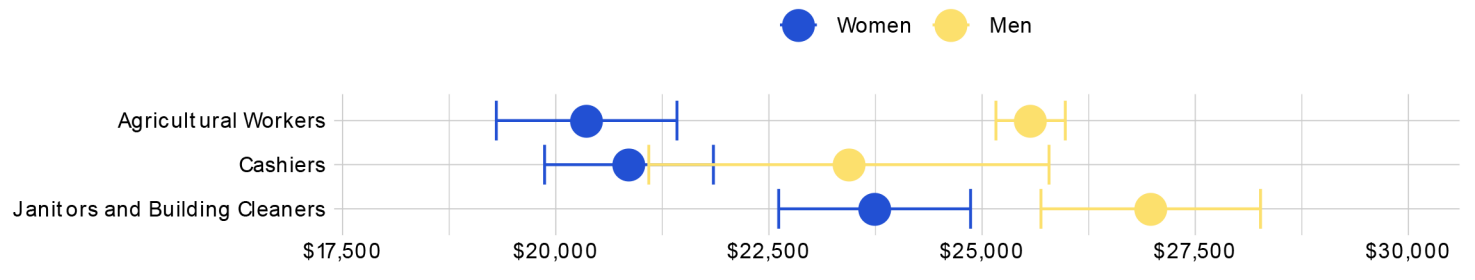
FIGURE 2: COMPARISON OF MEDIAN INCOMES WITHIN OCCUPATIONS, UNDOCUMENTED WOMEN AND MEN

Note: Estimates represent annual median income for full-time year-round worker, 2019 dollar.