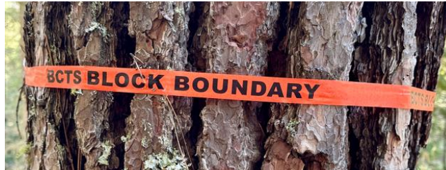
In 2024, we bushwacked over 30 proposed BCTS cutblocks within 75km of Nelson bearing witness and recording what will be lost.

BCTS, a government agency under the BC Ministry of Forests, manages approximately 17% of all unprotected forests in the province and accounts for about 20% of Crown land timber extraction.