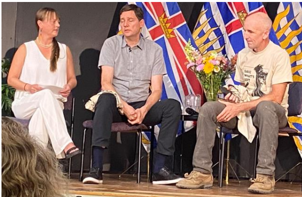
Giving Premier David Eby a Save What's Left T-shirt, Nelson BC, September 2024