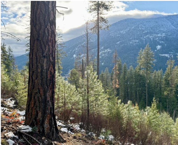
Looking out into a 10 year old tree farm, Slocan Park

These ecosystems hold immense ecological value compared to tree farms. We are part of a growing movement advocating for the protection of primary forests, which, of course, includes old growth.