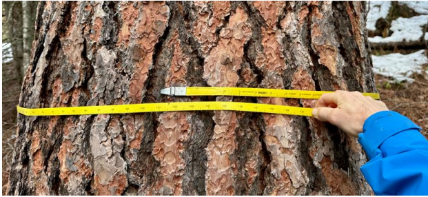
105cm Ponderosa Pine, BCTS cutblock, Slocan Park

Our overarching goal is to save what is left of BC's primary forests—forests that have seen minimal human disturbance and no past logging.