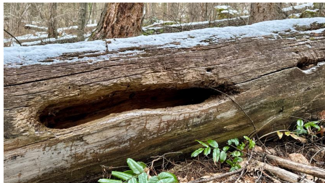
It's simple! Dead trees equal habitat, Slocan Park

We believe that meaningful forestry reform must start with the government's own timber extraction agency, as BCTS is responsible for more unsustainable logging of primary forests and more logging in community watersheds than any corporate entity.