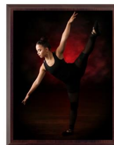
- Add 8x10 Cherry Wood Plaque - $29 (Print Not Included)