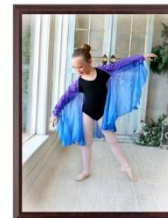
Add 5x7 Cherry Wood Plaque - $24 (Print Not Included)