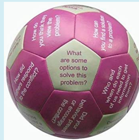
Thumbballs to stimulate sharing