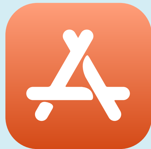
APPS under development