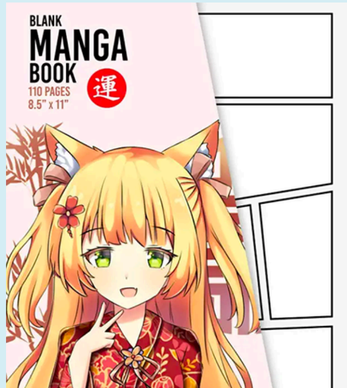
Write /Draw Your Own Story in a Manga

Fun games and apps to practice building skills using the conflict resolution process.