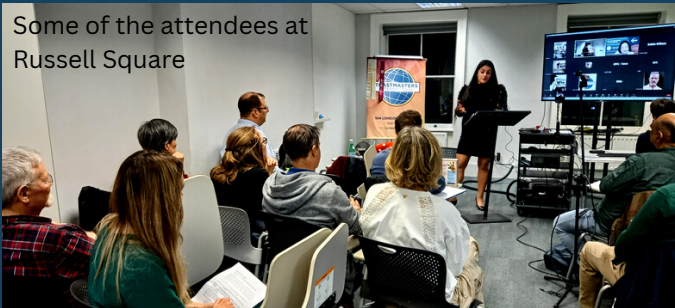
Some of the attendees at Russell Square

Tuesday 28th February 35 people met, 12 of whom online, for our hybrid debate meeting at 46-47 Russell Square, London. The motion for the prepared debate was: This House Would Keep Museum Artefacts Where They Are.