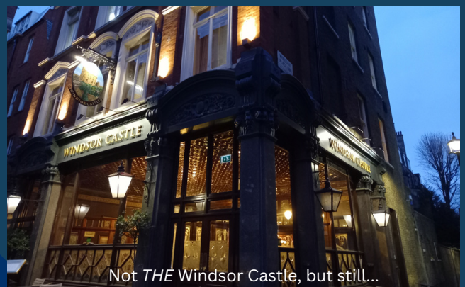
Not THE Windsor Castle, but still...

The new (old) meeting place is the Windsor Castle pub in Victoria, a 6 minutes walk from Victoria Station. Address: 23 Francis St, London SW1P 1DN