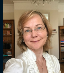
Lucie VPE (contact to volunteer for roles)