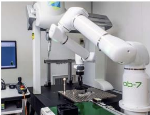
Quality Control & Inspection