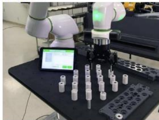
Assembly & Gluing