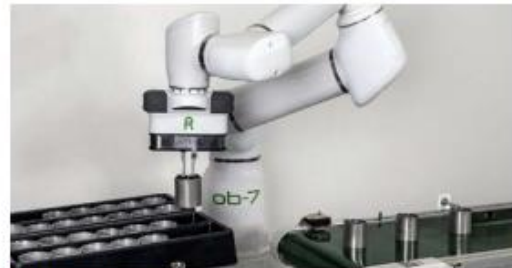
Pick & Place