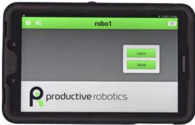
A Simple "No Programming" Interface

OB7 was designed to deliver unmatched automation productivity, accuracy, and Safety. And, you can do it all simply without complicated software programming and coding.