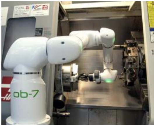
Machine Shop Loading & Unloading

OB7 productivity goes straight to your cash flow. With OB7 financing, the cash flow payback time is typically 10 days. Hourly lease cost is $3.50 per hour (single shift, 5 days/week) or less ($1.25/hr for 2 shifts-7 days/week). OB7 is generating cash in only 10 days.