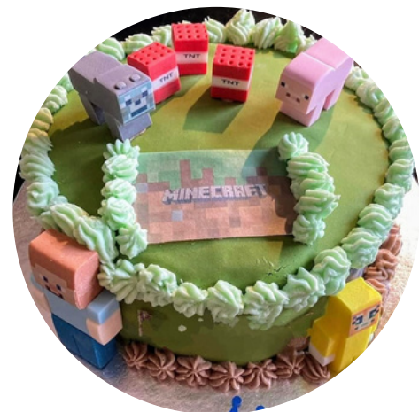
Cake by Free Cakes for Kids Southampton