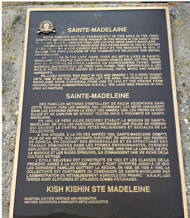
Plaque at Ste Madeleine Cemetery