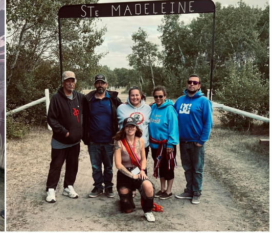
The volunteers who make this event a reality