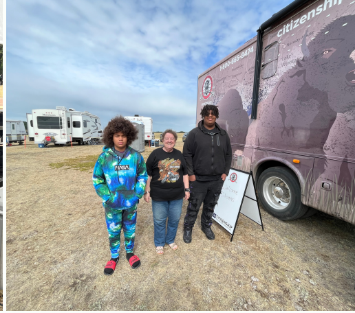
Métis Youth Volunteers and CRO Staff