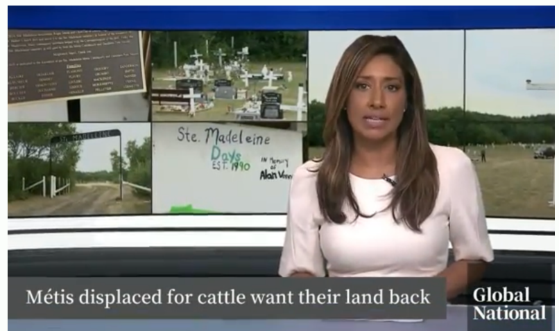
Métis displaced for cattle want their land back