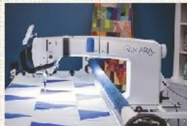
HandiQuilter Amara ProStitch