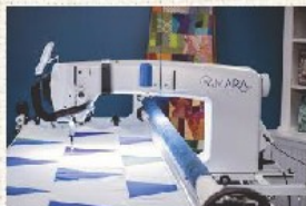
HandiQuilter Amara ProStitch