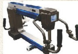
Innova M24 with Autopilot