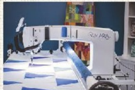
HandiQuilter Amara ProStitch