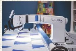
HandiQuilter Amara ProStitch