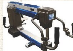
Innova M24 with Autopilot