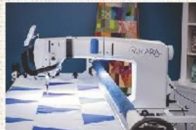
HandiQuilter Amara ProStitch