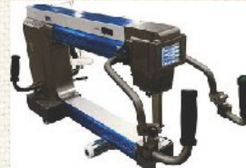
Innova M24 with Autopilot