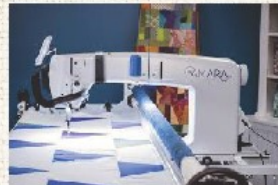
HandiQuilter Amara ProStitch