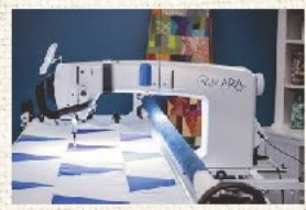
HandiQuilter Amara ProStitch