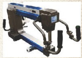
Innova M24 with Autopilot