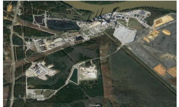
Plant Barry, 2023