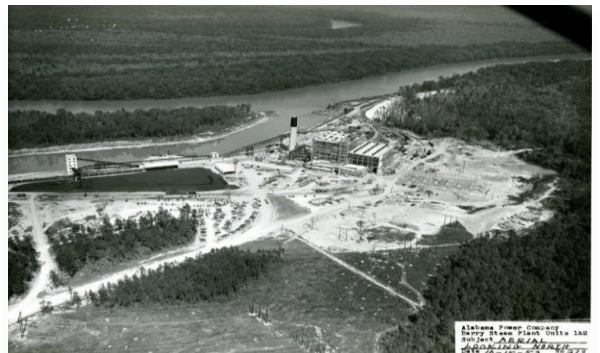
Plant Barry, October 15 th , 1953