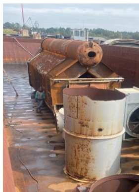
Obsolete package boiler equipment donated and submerged in the Gulf of Mexico to support the artificial reef program.