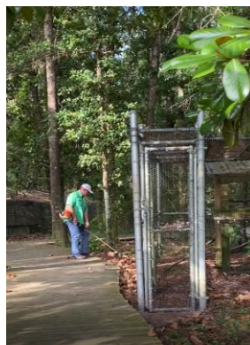
BEST members participating in a clean-up day at the Mobile County Public School System's Environmental Studies Center