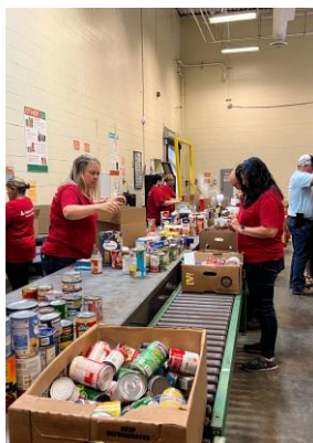
Feeding the Gulf Coast, Food Sorting and Boxing