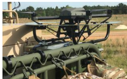
Autonomous Vehicle Mount