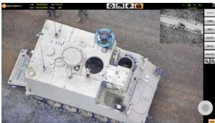
Ruggedized Tablet Control

The Livesky is a VTOL multirotor sUAS powered from the ground using a highly engineered resilient tether. As a persistent, multi-day, aerial platform it is currently used for ISR and Communications Relay. Deployable in minutes, it can be mounted on and operated from moving vehicles, on the ground, and on buildings, to enhance any and enable new missions.