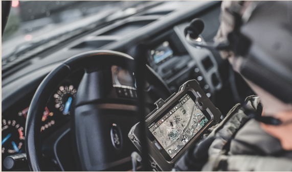
goTenna radio integration