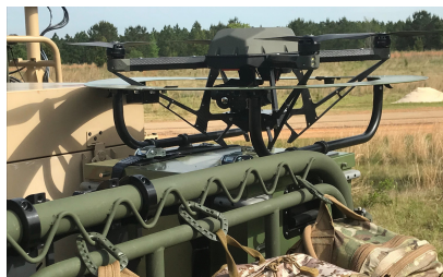
Autonomous Vehicle Mount