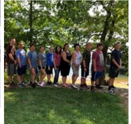
Youth Trip to McSpadden's @ Tablerock Lake...