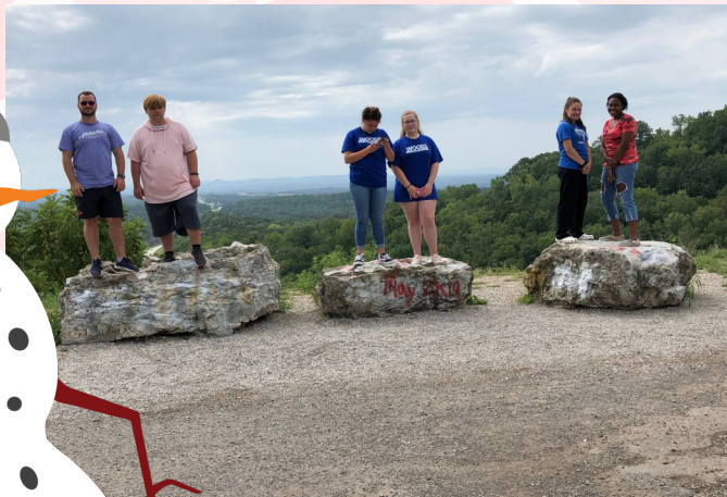
Summer trip to the McSpadden's 2019.

We have a busy year again and I hope you are ready to not just have fun but learn more about God. I'm not selling fun but want you to come with expectations of something different each and every time we meet. As always bring a friend!!!!