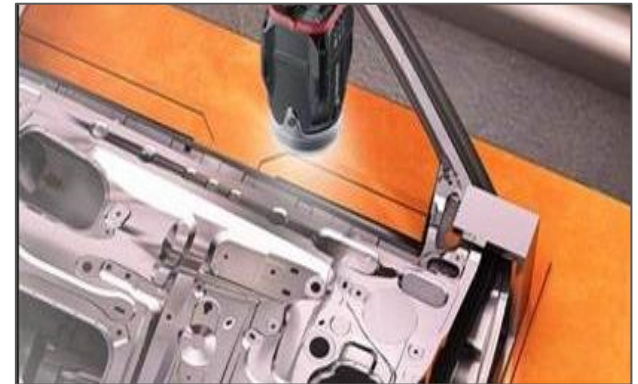
Vision Technology can ensure that Finished Parts are accurately Identified, Counted and Packed