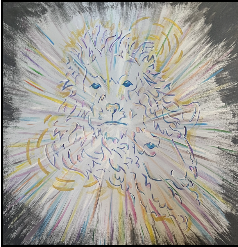
Artwork: "Lion & Lamb | Fiercely Gentle"