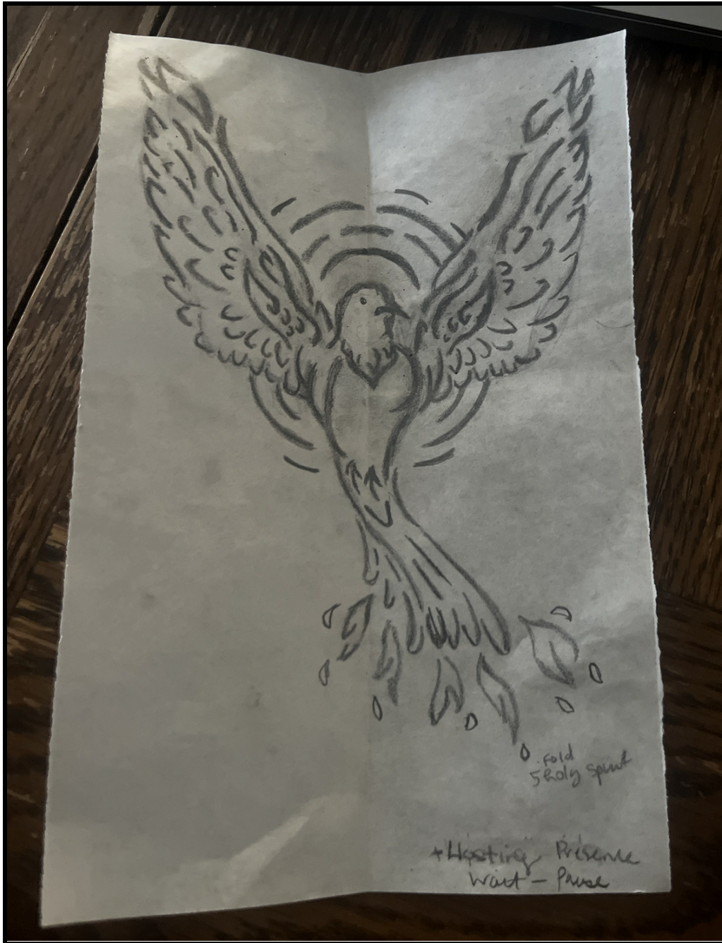
Sketch of Painting.