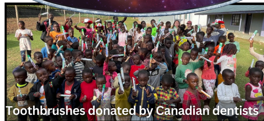
Toothbrushes donated by Canadian dentists

A team of 24 people visited MCCH in April, the largest team we have hosted thus far. Over the 10 days we were at MCCH, the team held a 2 day soccer camp followed by a 5 day Vacation Bible School. Our 92 Children were joined by approximately 50 children from the community. The team also enjoyed the children's evening devotional times. Encouraging one another and learning some songs of worship in Swahili with the them was awesome.