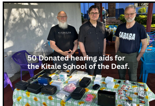
50 Donated hearing aids for the Kitale School of the Deaf.

Below - all the participants and our team. Thank you to the Sunshine Coast Youth Soccer Association who donated cleats, equipment, and over 300 jerseys. Thanks also to CC London for the VBS program, decor, and supplies.