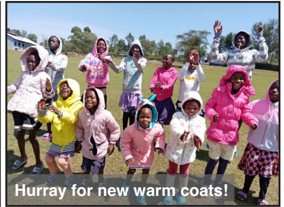
Hurray for new warm coats!