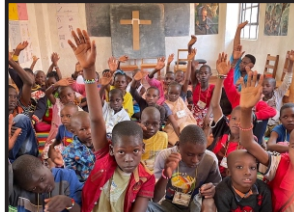
We gave our lives to Jesus today!