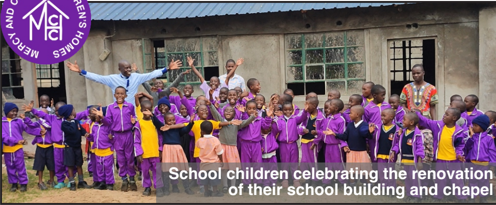
School children celebrating the renovation of their school building and chapel