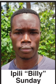
Ipili "Billy" Sunday