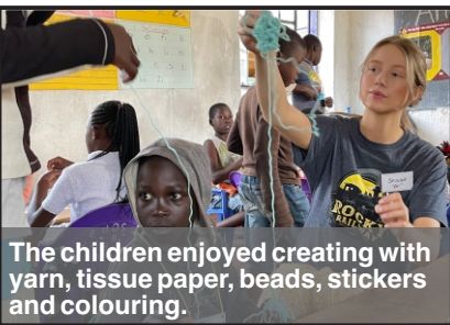
The children enjoyed creating with yarn, tissue paper, beads, stickers and colouring.