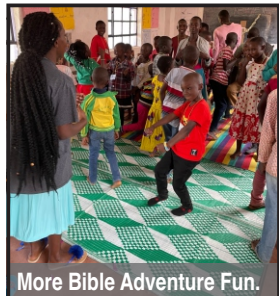
More Bible Adventure Fun.