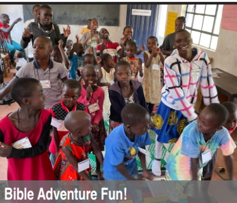
Bible Adventure Fun!