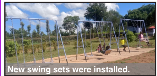
New swing sets were installed.