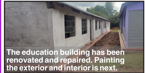
The education building has been renovated and repaired. Painting the exterior and interior is next.