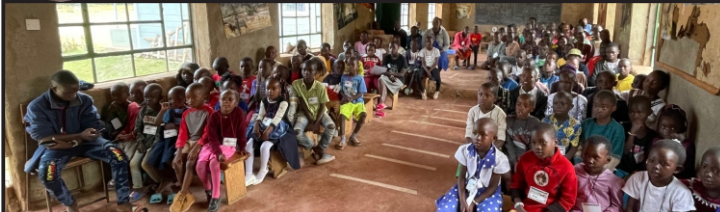
About 100 children attended the VBS. They are seated in the Children's Chapel that was renovated this summer.