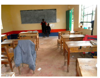
Blue and red stripe spruces up the classroom.

A new four inch foam mattress gets a thumbs up from children who formerly slept on a rice sack in a mud floored stick and tarp dome shaped home where water flowed through during the rainy season.