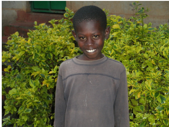
In In 2016 this photo was taken, and now this young man will start High School!!

Our Grade 9's have been integrated back into their Kenyan homes wherever possible and will begin their high school from there. Mercy and Caring Homes' social worker will be monitoring these homes to ensure the child's doing OK there. Uniforms and some school needs will continue to be provided by MCCH while at the same time the family is encouraged where possible to take responsibility for their child.