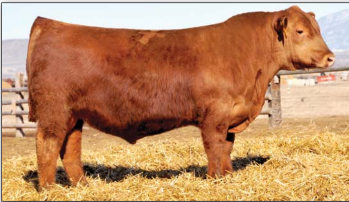
C-T Rio Grand 2044