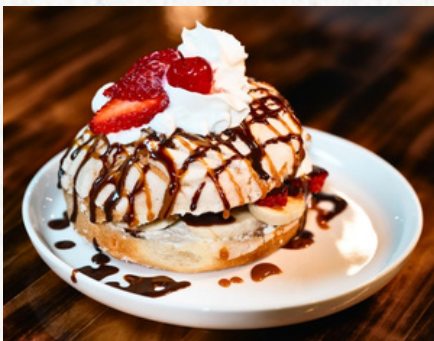
Concha Preparada $8