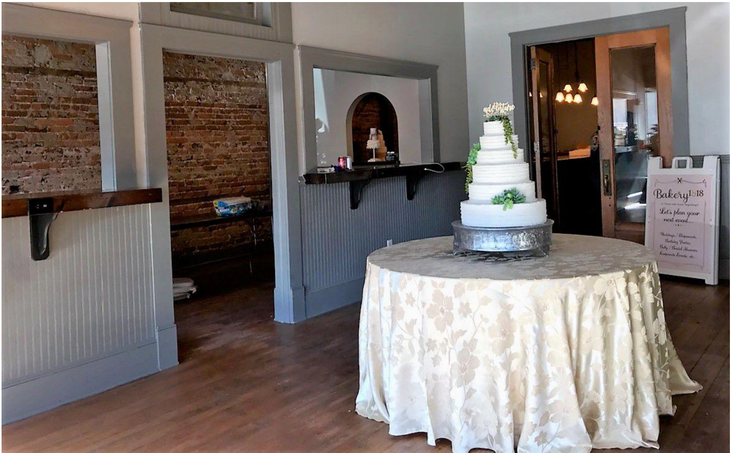
A six-tiered wedding cake pops on a table at the entrance of Bakery 1818.