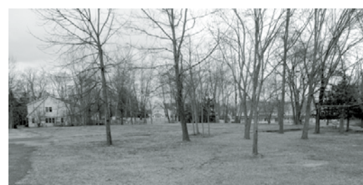
Red Hook - PRIME 2 acre land parcel zoned NMU that allows apartments and commercial use, has access to water and will have sewer in next phase, prime location last piece zoned for apartments, call Tom for details