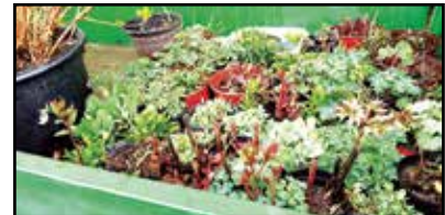
Plants Ready to go for the Plant Sale

Club members continue to learn about gardening at our monthly