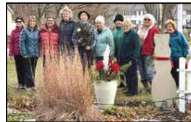
ODVGC members at work in Veterans Park Garden.

to community service. We maintain a large demonstration garden at Veterans Park in Red Hook and a smaller garden in Upper Red Hook at the Welcome to Red Hook sign. ODVGC