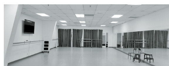
RED HOOK VILLAGE - 4500 foot flex space, formerly a fitness center, dance studio and an adult day care - many unlimited uses - warehouse distribution - retail - high ceilings - ample parking - Call Tom.