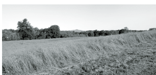
Green Pastures farm - 188 beautiful acres 60% cleared, well drained soils with a rolling topography, 2 acre zoned great for a farm operation, development or seasonal rentals. Property has a stream running through it and great catskill views on the western side. Ample road frontage and 20 minutes to Rhinebeck and 20 minutes to Hudson 5 miles to Taconic parkway. CALL TOM