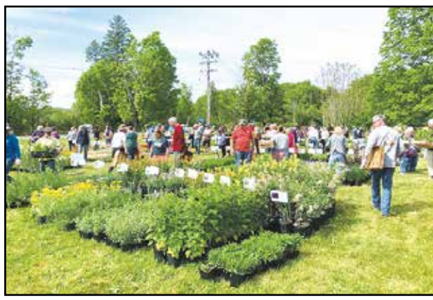
Shoppers at the 2024 Master Gardeners Plant Sale at the Farm and Home Center in Millbrook, NY.

For nearly five decades, the Master Gardener Volunteer Program has served Dutchess County, making it the first county in New York State to offer this esteemed volunteer opportunity. The program's mission is to train volunteers as peer educators, providing research-based knowledge to help the community manage gardens, lawns, and landscapes while emphasizing food security and environmental stewardship. "There are so many reasons why