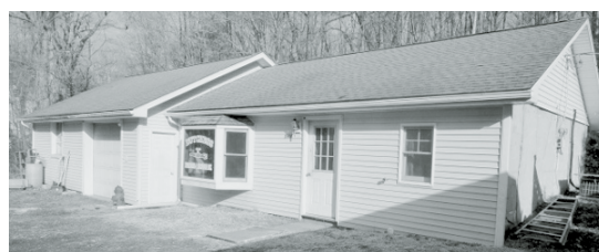
RHINEBECK - Unique opportunity. 3 buildings on one parcel. Building #1 a nice 3 bedroom cape with private back yard building. #2 is a nice neat 2 bedroom apartment with an open floor plan 1000 square feet. And building #3 is a work shop / studio was formerly a plumbing contractors office shop for 35 years. Unlimited potential for a small business, rental income property of a hard to find live-work situation. Call Tom for details.

LeGrand Real Estate Inc. does property management for commercial, residential, multi-family and land. We provide 7 day a week service. We do leasing, quality control and profitability studies. We provide real property services mowing, bush hogging, snow service and manage general repairs, septic issues and maintenance issues. Land use zoning and planning approvals are all a part of what we do. We take the worry out of owning property Call today and see how we can help you.