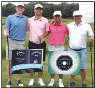
1st Place Winners - 2024 Anderson Golf Classic Tournament Winners

Founded in 1924, Anderson provides award-winning educational, vocational, residential, clinical, and training programs for people locally, regionally, and all over the country.